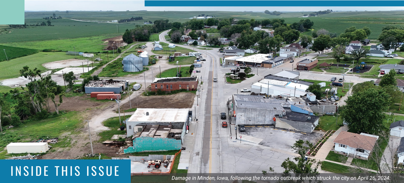
Damage in Minden, Iowa, following the tornado outbreak which struck the city on April 26, 2024.