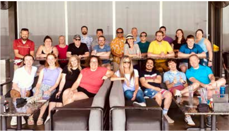
The whole office joined in the fun at TopGolf.

continued from Pottawattamie Co. Housing Trust Fund announces awards