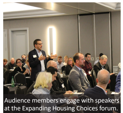
Audience members engage with speakers at the Expanding Housing Choices forum.