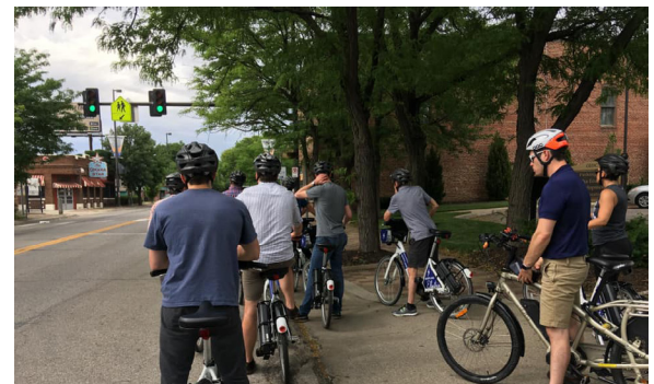
A local biking enthusiast and planner along with MAPA staff led conference attendees on a biking history tour of neighborhoods around Downtown and Midtown Omaha.