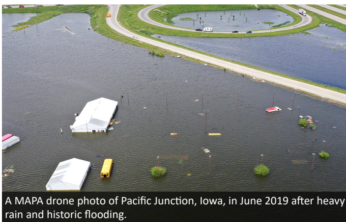
A MAPA drone photo of Pacific Junction, Iowa, in June 2019 after heavy rain and historic flooding.