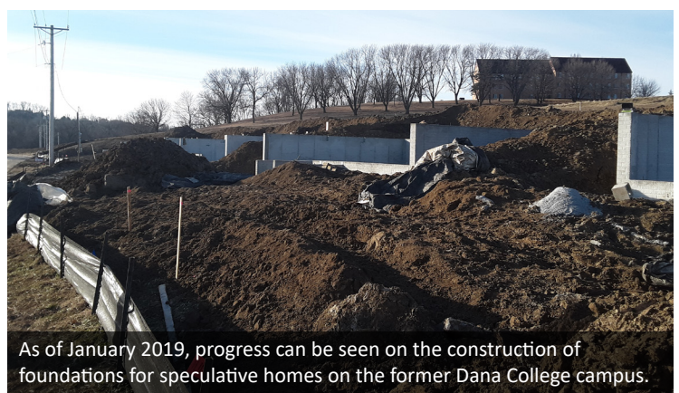
As of January 2019, progress can be seen on the construction of foundations for speculative homes on the former Dana College campus.