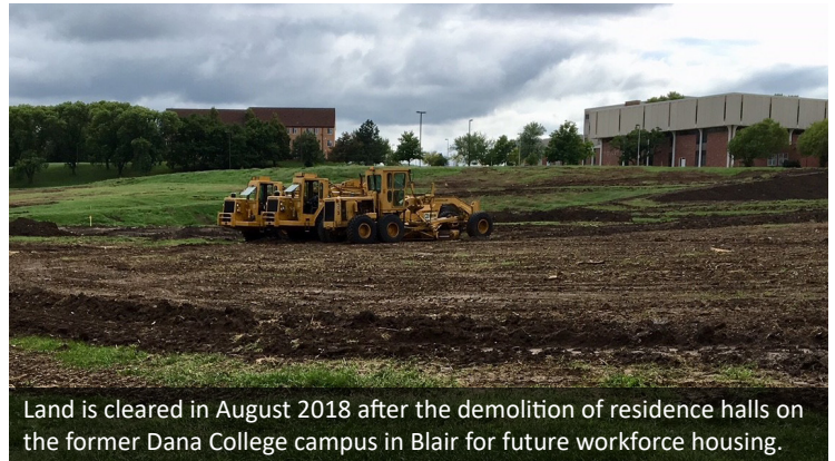
Land is cleared in August 2018 after the demolition of residence halls on the former Dana College campus in Blair for future workforce housing.