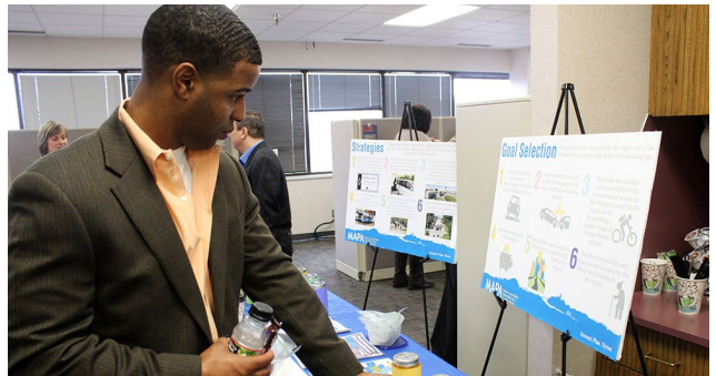
A Council Bluffs Chamber of Commerce member reviews goals and strategies for long range transportation needs during the "Coffee and Contacts" event on March 8th.