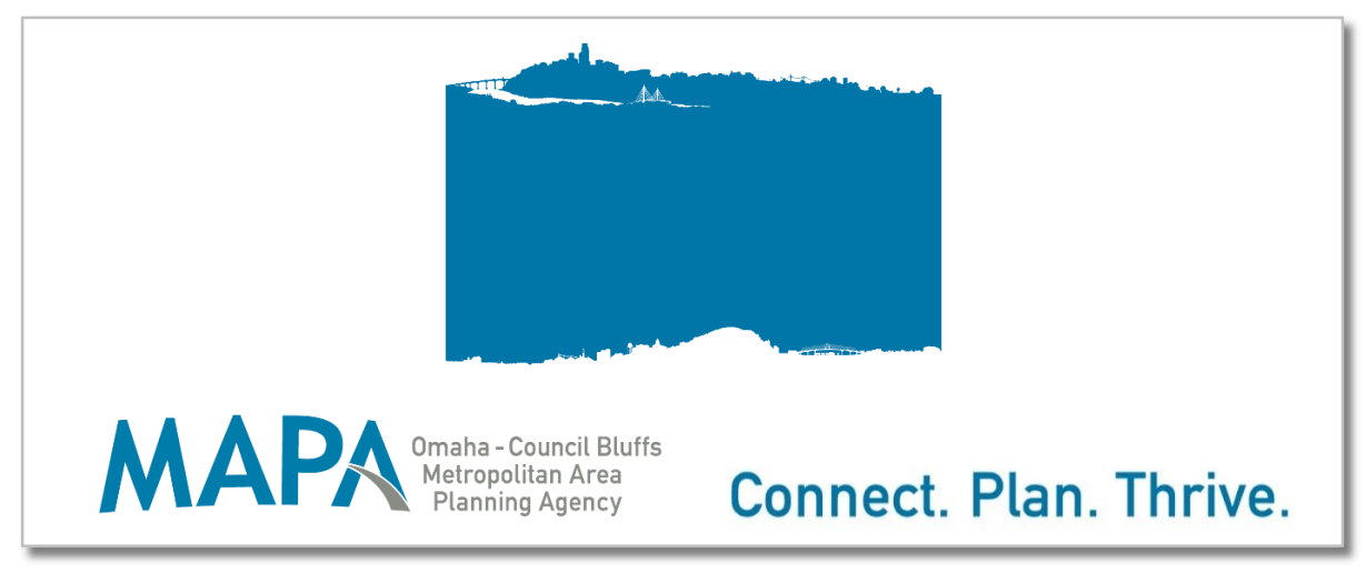
Figure 3: A Portion of MAPA's New Branding Brief

MAPA also completed a new branding brief, which reimagined MAPA's logo and other branding materials. These are shown in Figure 3.