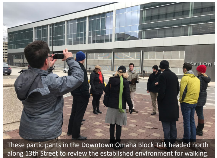
These participants in the Downtown Omaha Block Talk headed north along 13th Street to review the established environment for walking.

The Heartland 2050 mini-grant from federal Surface Transportation Block Grant (STBG) funds, in conjunction with a $25,000 investment from the City of Omaha, will support the work and momentum of 13th Street and offer viable options to increase the corridor's economic vitality.