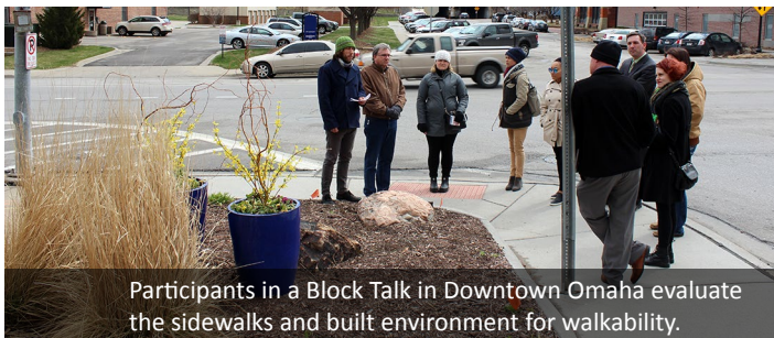
Participants in a Block Talk in Downtown Omaha evaluate the sidewalks and built environment for walkability.

MAPA's Heartland 2050 regional vision project hosted three "Block Talks" during April to help residents assess the walkability of their neighborhoods and offer suggestions on changes they would like to see made to the physical environment to improve access for pedestrians. The Block Talks are part of the ongoing revitalization of 13th Street, which includes a walkability study conducted by the City of Omaha.