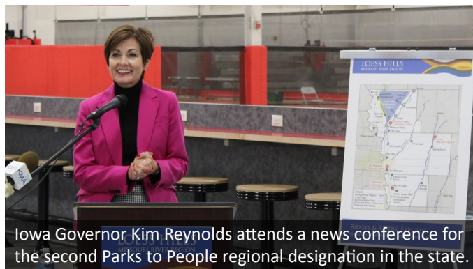
Iowa Governor Kim Reynolds attends a news conference for the second Parks to People regional designation in the state.

www.goldenhillsrca.org/loess-hills-missouri-river-region-parks-to-people-plan .