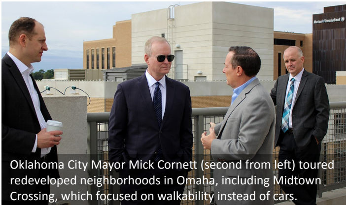
Oklahoma City Mayor Mick Cornett (second from left) toured redeveloped neighborhoods in Omaha, including Midtown Crossing, which focused on walkability instead of cars.

On Oct. 4, Cornett toured parts of the Blackstone and Midtown Crossing neighborhoods in Omaha as part of a visit arranged by the Omaha-Council Bluffs Metropolitan Area Planning Agency (MAPA).