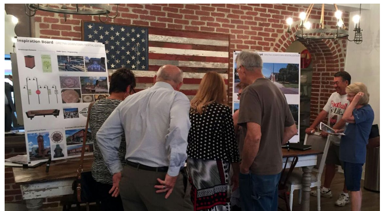
Gretna residents look at a streetscape concept for the downtown revitalization plan at an open house event on July 26.