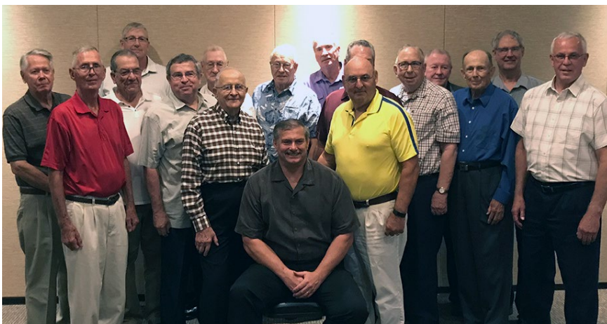
Volunteers for the MAMA program were celebrated at the annual dinner on July 27.