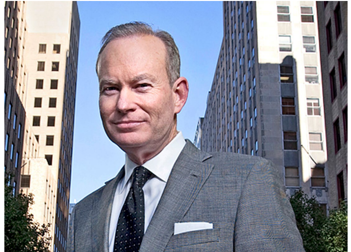
MAYOR MICK CORNETT Oklahoma City Mayor

RSVP by Sept. 22, 2017 to Christina at cbrownell@mapacog.org or call: 402-444-6866, ext. 210. Cost is $30. No refunds will be made after Sept. 29, 2017.