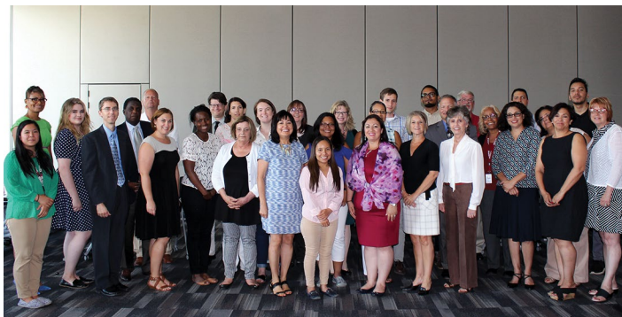
Attendees of the 2020 Census meetings represented many interests in the community and discussed participation barriers.

Acting in its role as a convener, MAPA staff organized and facilitated government and community meetings in July with the U.S. Census Bureau as it helps communities prepare for the 2020 Census.