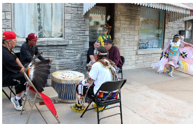
The Young Spirit Dancers and Upstream Drumming group performed for participants as a part of the stroll down South 10th Street.