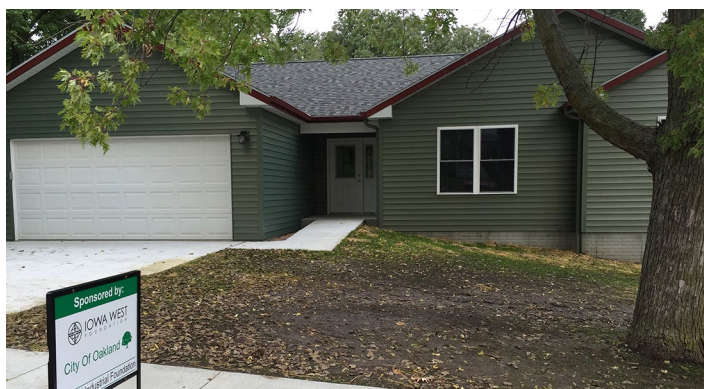
The City of Oakland finished the first home as a part of the Oakland Revolving Housing Fund to help with infill development for housing in the community. A second home will be built in 2017.

For the second home, construction will begin in the spring of 2017. The proceeds from the sale of both market rate homes go into the Oakland Revolving Housing Fund to finance additional infill development in the future.