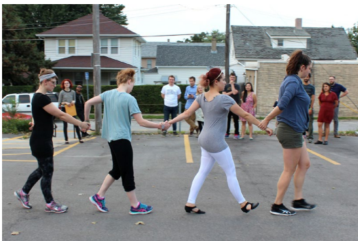
The (make)shift dance collective performs for a group along the South 10th Street corridor interactive walk.