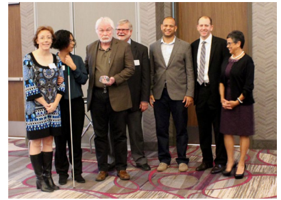
The Omaha Planning Department receives the Regional Service Award for the Prospect Village Initiative.

The Regional Service Award is given to a group that has made a contribution to the metropolitan area to help it improve or grow. The City of Omaha Planning Department partnered with 25 organizations to create and implement a holistic neighborhood revitalization model in Prospect Village, a distressed, racially-mixed neighborhood in North Omaha. As a result of the broad spectrum of community partners' needs were met through new housing construction, existing housing rehabilitation, healthy home and energy-efficiency upgrades, establishment of community gardens, cultural fairs, neighborhood art projects, financial management training, parenting classes, gang prevention initiatives and formation of a viable neighborhood association.